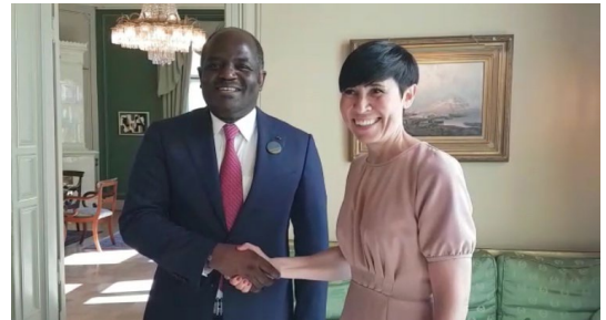
Minister Régis Immongault Tatangani and Ine Eriksen Søreide, Norwegian Minister for Foreign Affairs. (Norway)

The Minister conveyed the message of the President of the Republic, His Excellency Ali Bongo Ondimba, in his capacity as Coordinator of the Committee of African Heads of State and Government on the Climate Change (CAHOSCC), with a view to create awareness and mobilise additional resources for the African Adaptation Initiative.