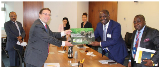
Minister Immongault Tatangani and Mr. Achim Steiner, Administrator of UNDP (New York)

The commitment and leadership of the Gabonese Head of State was hailed by all the participants who expressed their willingness to make the AAI an instrument for the implementation of the Paris Agreement and, by confirming their participation in the high-level round table, to be held in September 2018 on the sidelines of the 73rd UN General Assembly. The objective of the roundtable is to mobilize the 5 to 30 million US dollars necessary for the implementation of the AAI, and to launch a report on the State of Adaptation in Africa.