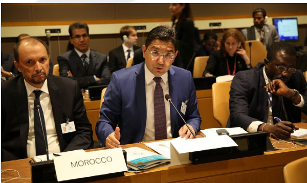
Participants during the AAI High-Level Partners Roundtable