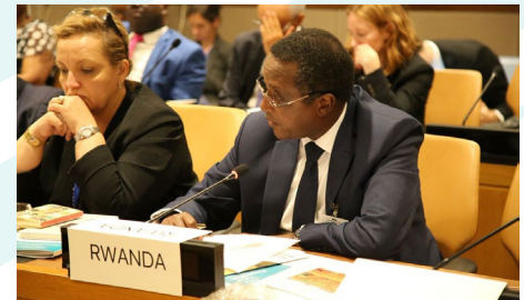
The Minister of Environment for Rwanda, H.E. Vincent Biruta

As the UNDP Administrator stressed in his opening remarks, however, African governments are already spending deeply on climate adaptation: “Africa is already investing well over 2 per cent of its GDP, that is our estimate, in adaptation. That's 10 times the ODA (Overseas Development Assistance) that is coming to the continent!” And despite this heavy commitment by African states, the continent still has an adaptation finance gap that ranges from 40 per cent to 80 per cent. Addressing this adaptation gap is one of the fundamental goals of the AAI.