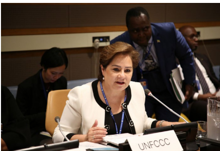
H.E. Patricia Espinosa, the Executive Secretary of the United Nations Framework Convention on Climate Change (UNFCCC)

Very strong messages of support for the AAI and its work were recorded from all sides. According to H.E. the AU Commissioner, “the AAI, represents an opportunity for Africa to achieve agenda 2063” . The Minister of Environment for Rwanda, H.E. Vincent Biruta, stated with directness that “The Africa Adaptation Initiative is critical for our continent for a number of reasons.”