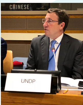
Mr. Achim Steiner, UNDP Administrator

In her opening remarks, the African Union Commissioner for Rural Economy and Agriculture, H.E. Josefa Leonel Correa Sacko, stressed the critical importance of climate adaptation in Africa. She highlighted how climate change affects the most important and productive sectors of Africa's economies (such as food production) and therefore contributes to increased poverty and mass migration. She stressed that climate change represents a security threat for Africa.