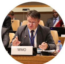
Mr. Petteri Taalas, WMO, Director General

A crucial starting point for addressing climate adaptation in Africa is reducing the gap in climate information services and infrastructure – another of the AAI's priorities. This will have a beneficial impact on numerous sectors, including agriculture, public safety, transport, energy, health. The approach was supported by Mr. Petteri Taalas, the World Meteorological Organisation Director General, who stressed that “one very powerful way to adapt to climate change is to invest in early warning services, weather, climate, and water.”